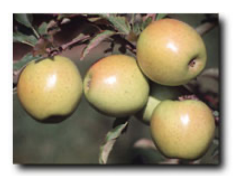
(Enterprise Apple' (Co-op 30) <a href="https://www.hort.purdue.edu/newcrop/pri/coop30.html">https://www.hort.purdue.edu/newcrop/pri/coop30.html</a> (PRI 2693-1 = PRI 1661-2 x PRI 1661-1) (Korban et al. 1990) Introduced as 'Enterprise' in 1993; U.S. Plant Patent No. 9,193

PRI 2750-6 = (Co-op 17 (PRI 1689-100) x Golden Delicious) (Crosby et al. 1993) Introduced as 'GoldRush' (Crosby et al. 1994) U.S. Plant Patent No. 9,392.