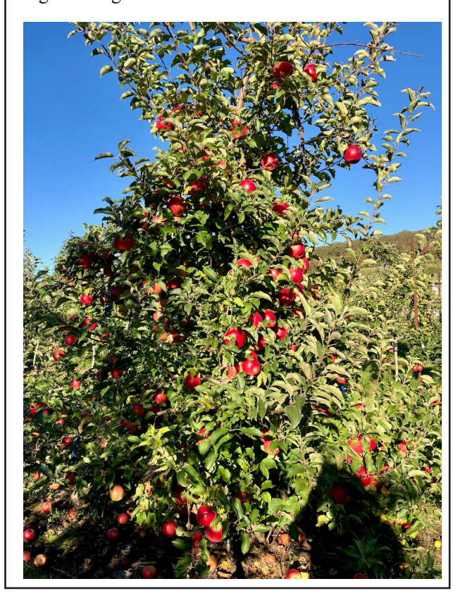
Figure 1. RubyRush tree on M.7 rootstock at the UMass Cold Spring Orchard, 16 October 2018. Note high tree vigor.

than October 1, with a two-week picking window and little drop. RubyRush fruit are large and very attractive with a bright pink-red solid color blush covering 75% of the surface. Background color will change from green to green-yellow with maturity. Flesh is fine-medium textured and quite firm with a tart-sweet flavor. Watercore can be an issue in some years. Eating quality is generally good, maybe very good, but does not have the 'snap" of a Honeycrisp or GoldRush.