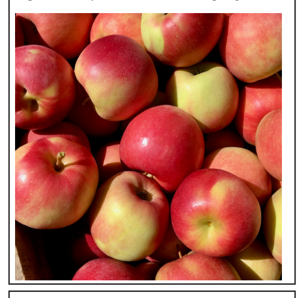
Figure 4. RubyRush - Rutgers Sndyer Research and Extension Farm.