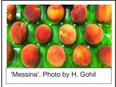
'Messina'.

Messina (NJ352) is a yellow-fleshed, firm peach. Fruit is large and has a traditional appearance and excellent combination of sweetness and acidity. Fruit ripens