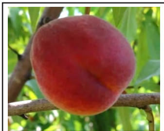
'Felicia'.

Evelyn (NJ357) is an early August, yellow-fleshed, firm peach with semi freestone. Ripens 2 days before Redhaven Few varieties tick as many boxes as Evelyn. The full scarlet color with slight greenish-yellowish traces on the skin helps in picking decision. Fruit has sweet and low acidity flavor. Evelyn is already liked by ACN any commercial growers for its firmness and size. Tree is consistently productive and has low susceptibility to bacterial spot.