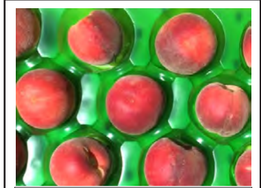
'Anna Rose'.

Anna Rose (NJ360) was introduced in 2020. It is an early August, white-fleshed, freestone peach. Fruit ripens 1 day after Redhaven, near White Lady and before Klondike.