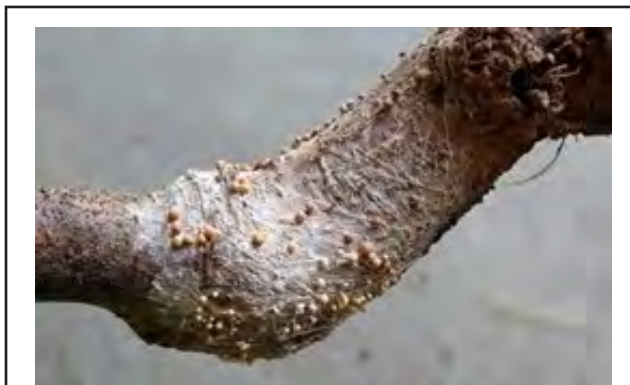
White hyphae and small, tan sclerotia from the southern blight fungus around the base of an apple tree.

People have known that Southern blight can cause problems on apple trees for nearly 100 years. It was a particular problem on nursery trees and young apple trees in the South. The pathogen thrives in warm, moist soil. The optimum temperature for S. rolfsii growth is about 85 F, which is a very warm soil, with relative soil water content of 30% or higher (Dong et al. 2022). But it appears, as with the summer fruit rots, the warming climate is making Southern blight more common in the Northeast. Southern blight is a problem in apple production areas around the world, particularly in warmer climates. In a 2008 study, researchers showed that the pathogen doesn't survive the cold winters of North Dakota and Iowa, but did survive in North Carolina and Georgia, supporting the idea that a warming climate may increase Southern blight problems in more northern regions (Xu et al., 2008).