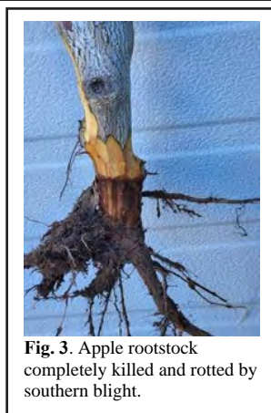
Fig. 3. Apple rootstock completely killed and rotted by southern blight.

S. rolfsii likes warm climates and soil. Perhaps the fungus has always been in Massachusetts soils, but didn't cause problems because the cool climate, particularly cold winters, kept it in check.