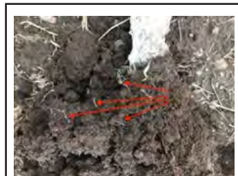
Fig. 2. Red arrows pointing to white hyphae in soil from the southern blight fungus. The white at the base of the trunk is paint.