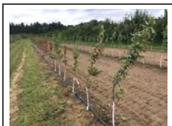
Fig. 1. New apple planting showing tree-dieback caused by southern blight.

It could have been in the soil at or near the planting site. In that case, why didn't it cause problems before 2017? Perhaps new, young trees are more susceptible. Or maybe it's because climate in Massachusetts has gotten warmer (Figure 4). Soil temperature tracks closely with air temperature, and as mentioned above,