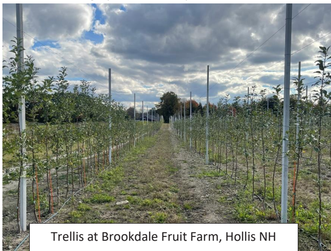
Trellis at Brookdale Fruit Farm, Hollis NH

Brookdale Farm Supplies has partnered with Valente for distribution in the United States. Valente's concrete posts are prestressed, reinforced posts that are trapezoidal shaped, with four smooth sides and no edges. This design prevents wear on hail netting and coverings. Valente trellis can be used in apple orchards, cherry orchards, vineyards and more. The system can be designed three different ways; standard trellis support, tall trellis support for future netting, or tall trellis with hail or over coverings included.