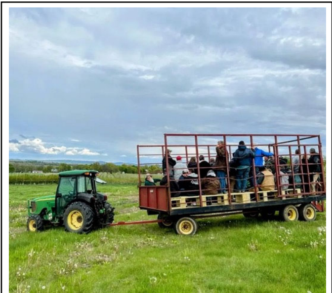
An orchard tour at the Northern New Jersey Tree Fruit Twilight meeting in May held at Melicks Town Farm , Oldwick, NJ. There were over 30 growers in attendance.