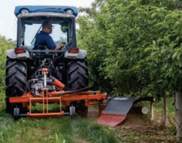
SLR-Sucker Remover Great for sucker and weed control.