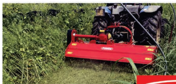
Shredder/Flail Mowers Ideal for chipping brush, managing field edges, handling cover crops