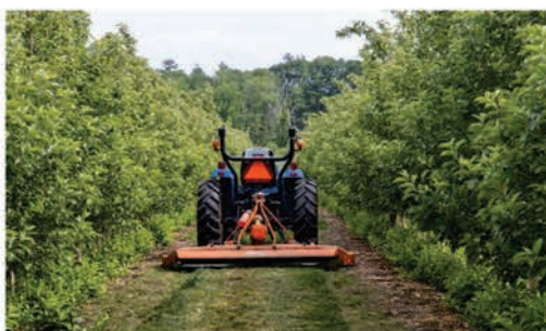
RAS-Rotary Mower. Ideal for mowing orchard rows.