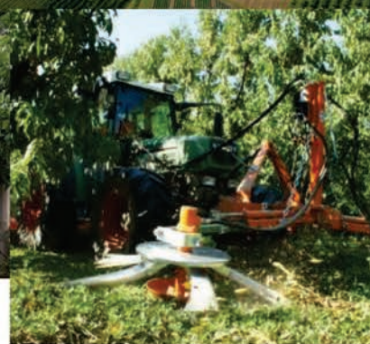
Sweeper Ideally for keeping under the trees clean for PYO.