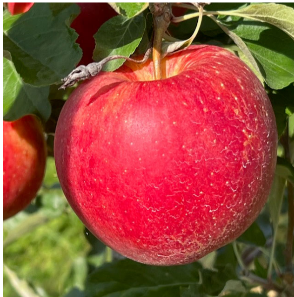
Figure 3. MAIA-Red Zeppelin at the UMass Orchard, Belchertown, MA, September 16, 2024.

MAIA-Red Zeppelin (Figure 3) is a newly named MAIA apple, with attractive red skin (obviously!), tart-sweet flavor, modest size, and a good crunch. Although we have only seen it cropping for a year, it clearly deserves attention.