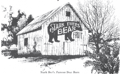
Stark Bro's Famous Bear Barn