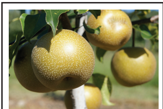
Shinko Asian pear fruit in 2011 at the UMass Cold Spring Orchard in Belchertown, MA.

end of the study. Annual fireblight counts to evaluate fireblight susceptibility will be taken. Of greatest importance will be the evaluation of fruit quality. Three years of fruit quality data will be taken to identify the