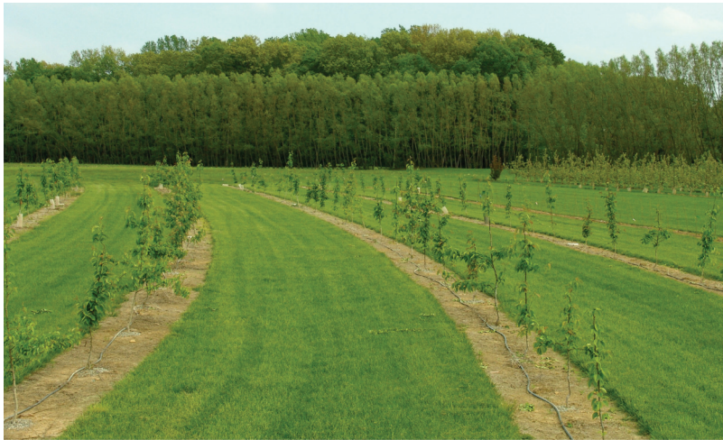
The 2010 Asian Pear Trial at the Rutgers Snyder Research & Extension Farm, Pittstown, NJ.