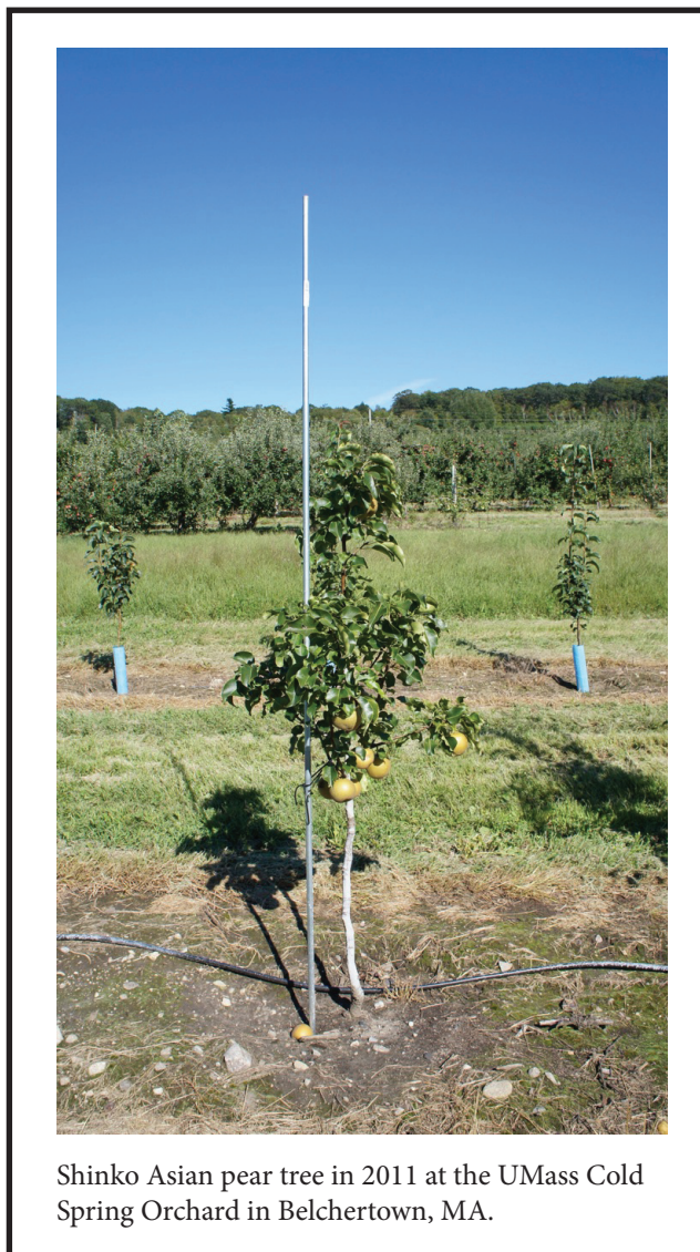
Shinko Asian pear tree in 2011 at the UMass Cold Spring Orchard in Belchertown, MA.