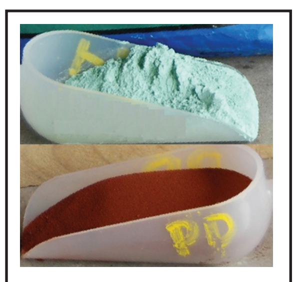
Figure 1. A typically pale-blue formulation of basic copper sulfate (top) contrasts with the red color of copper oxide (Nordox, bottom). Both products are effective for applications on tree fruits.

Copper products registered for tree fruits are almost all "fixed coppers" that have low solubility in water. In fact, many of the fixed copper compounds are considered totally insoluble in water in their purest forms. However, tests of formulated copper products usually show water solubility in the range of 2 to 6 mg of copper per liter. When these fixed copper products are mixed with water in a sprayer, the spray solution is actually a suspension of copper particles, and those particles persist on plant surfaces after the spray