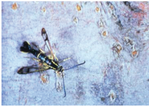
Adult dogwood borer female (left) and male (right).