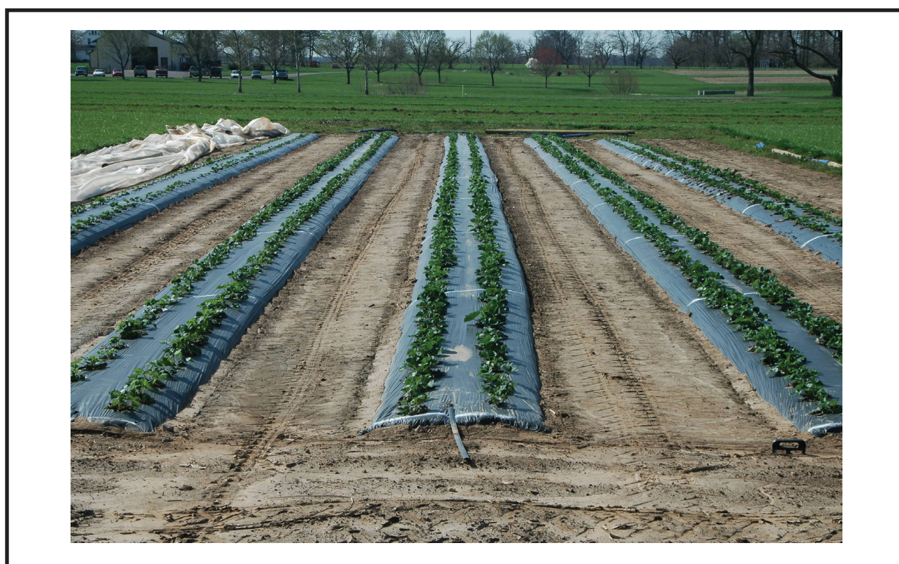
Figure 2. Replicated Field Trial Plots, Rutgers Snyder Farm, Pittstown, NJ April 4, 2010.