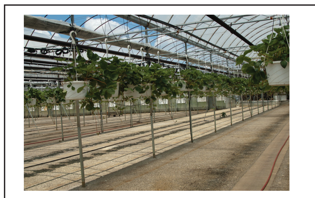
Figure 4. Strawberry Runner Tip Production at Kube-Pak Corp., Allentown, NJ.