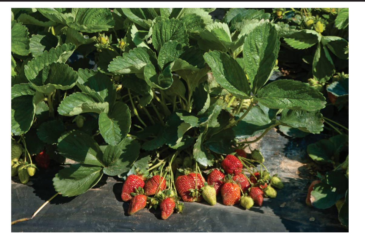
Figure 5. Rutgers NJAES – An Advanced Strawberry Selection.