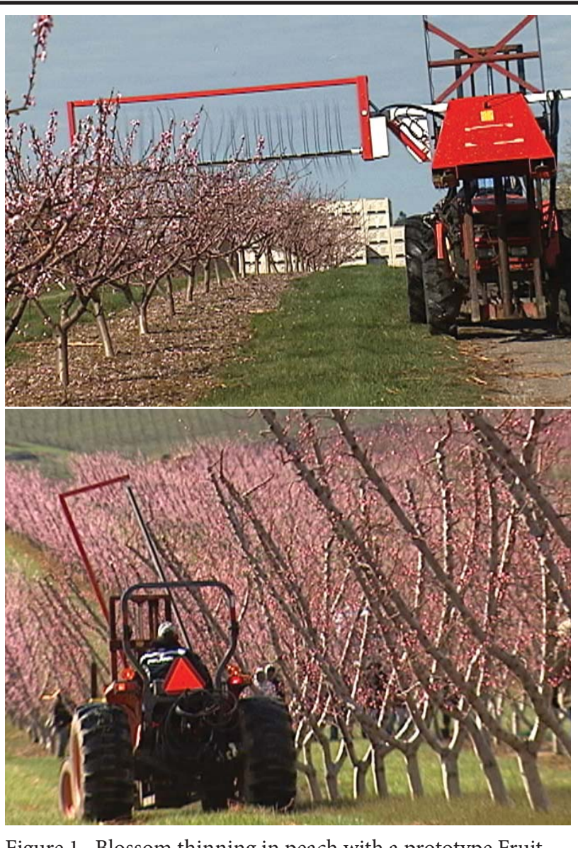
Figure 1. Blossom thinning in peach with a prototype Fruit-Tech PT250.

cessing plantings in 2009 to 2011. String thinner trials with variable tree forms uti-