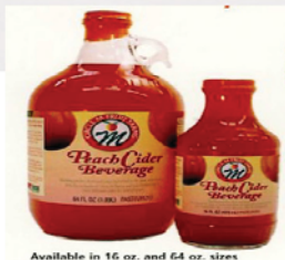
Available in 16 oz. and 64 oz. sizes

Made from fresh New Jersey Peaches "Peach Cider Drink, Peach Salsa, Peach Preserves"