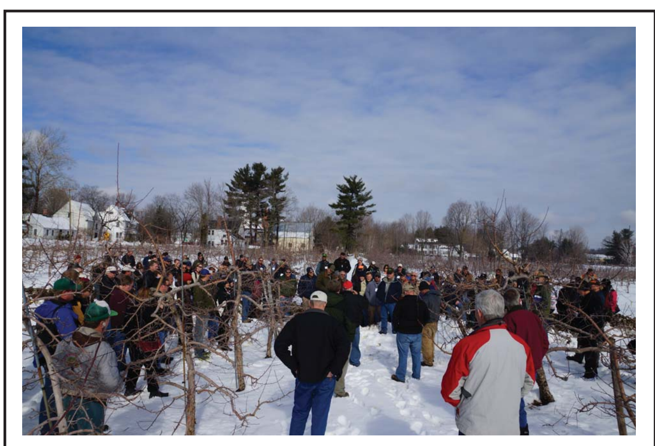
IFTA Annual Meeting Tour visited Brookdale Farm in Hollis, NH.

Then, on Sunday, despite the weather, the show