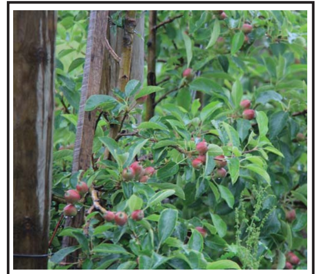
Fruit set at Stony Hill Farms looked great, pictured here before chemical thinning.