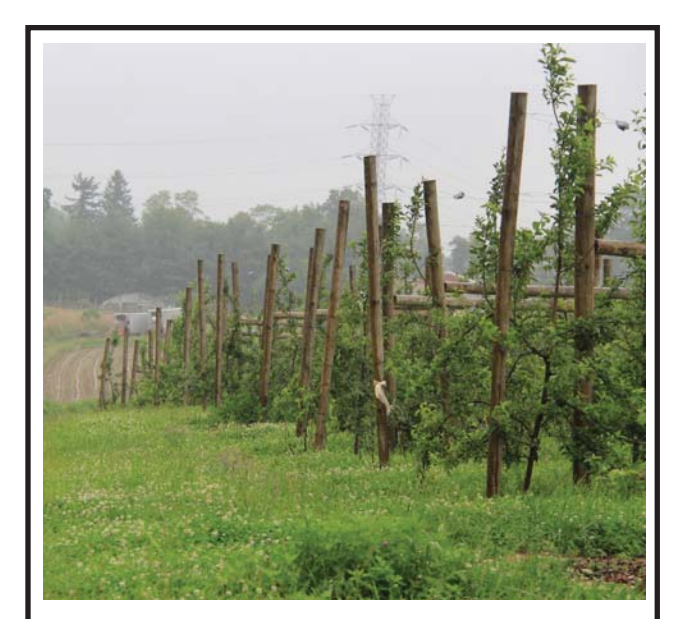
Tall spindle (planted 2009, 3'x14') in 2013 at Stony Hill Farms. This block used for their new pick-your-own operation.