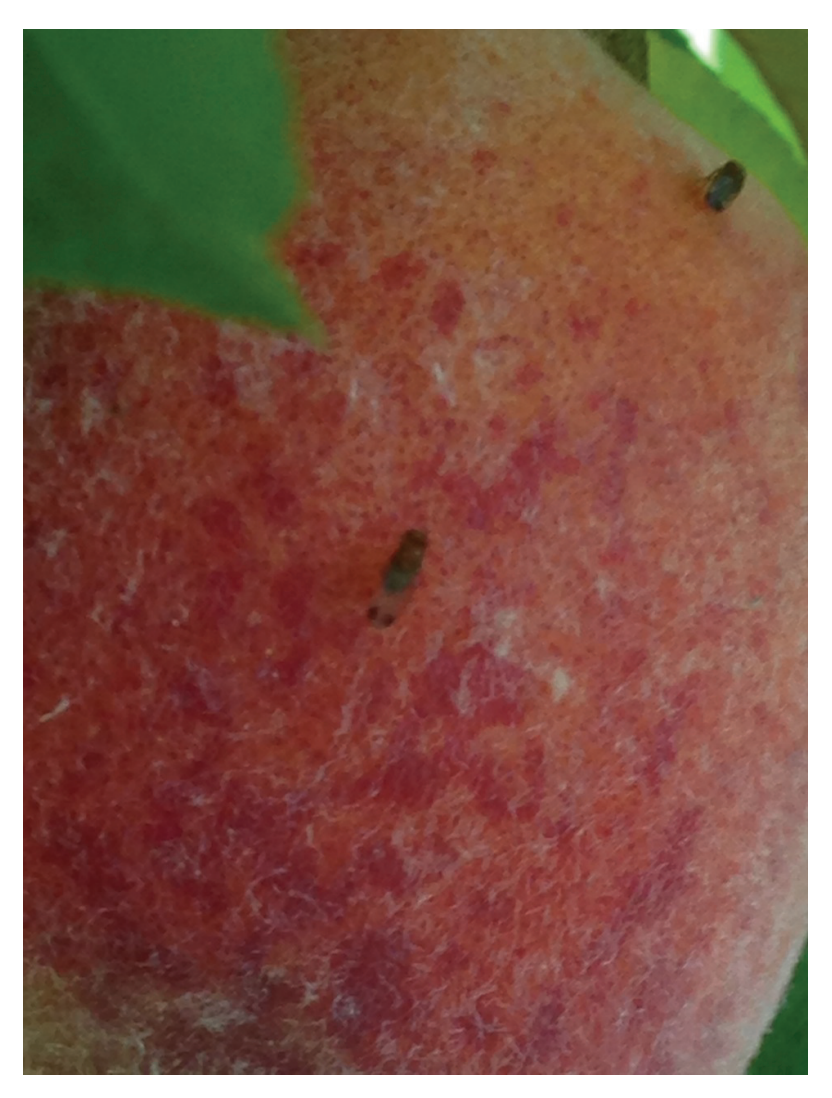
Spotted wing drosophila on peach.

and Fontelis® for apple scab (J. Clements).