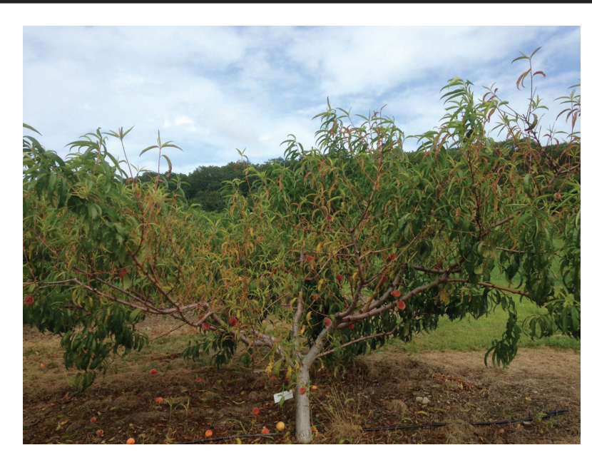
Peach X-disease at UMass Cold Spring Orchard, Belchertown.

Depending on interpretation of beginning and end of primary scab season and model used, there were only 4-5 primary apple scab infection periods in 2013. Once again (as in 2012), dry weather between green tip and bloom resulted in no scab infection periods during this time. Then, depending on model, there were 3-4 infection periods during May (in some locations backto-back), and one during the first week in June when