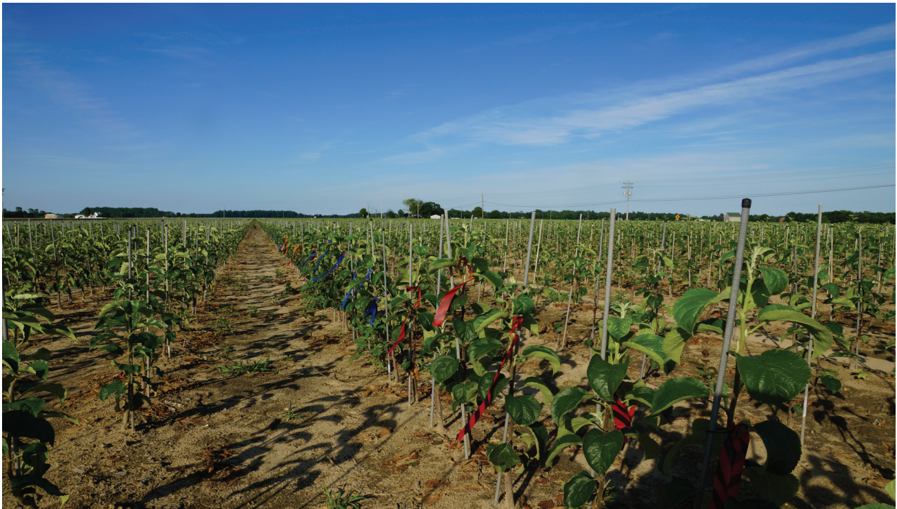
Bracing research treatments at Adams County Nursery in Milton Delaware, June 14, 2013 with various plant growth regulators.