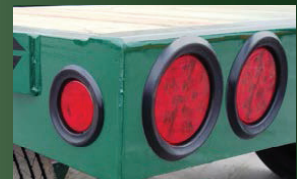
Optional LED Light Packages

Covered by Diller's Exclusive 3 Year Warranty