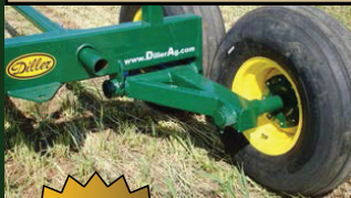
Optional Walking Beam Axles