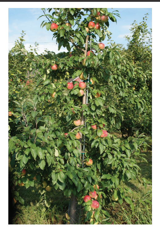
Figure 2. Control Zestar! apple tree on August 21, 2014 at UMass Cold Spring Orchard.

The row was divided into four replications, and two treatments: Blush vs. contrl. Each treatment group was 10 trees, therefore a total of 40 trees for each treatment. Two applications of Blush were made: July 30, 2014 and August 12, 2014. These timings represent about 30 and 14 days before anticipated harvest, respectively. Blush rate was 52 fluid ounces per acre. applied in a water volume of 75 gallons per acre