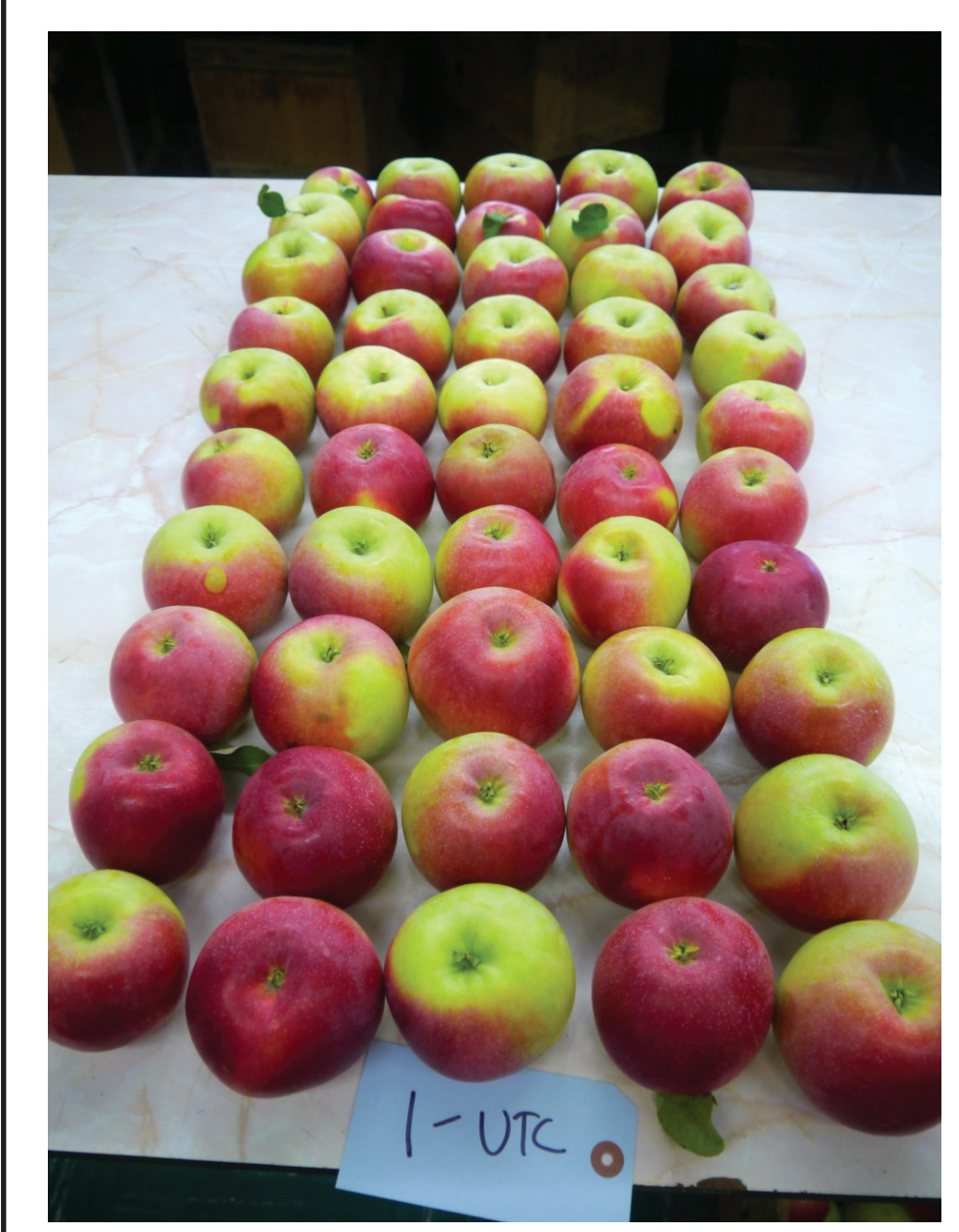
Figure 4. Zestar! control apples evaluated for percent red skin over-color and red skin brilliance.

ing harvest. Perhaps, application of Blush to Zestar! during a warmer pre-harvest maturity season would give different results. Timing and rates could also be adjusted. Application to larger (200 gallons per acre or larger) Zestar! apple trees with more 'green' fruit might also benefit from Blush application. Perhaps Blush just does not give enough measurable improvement to color of Zestar! apples to justify the expense? But, growers in the east and mid-west would for certain like to have a tool to significantly improve color of Zestar! apples, particularly those growers who bring Zestar! to a broker for packing and distribution to regional supermarkets.