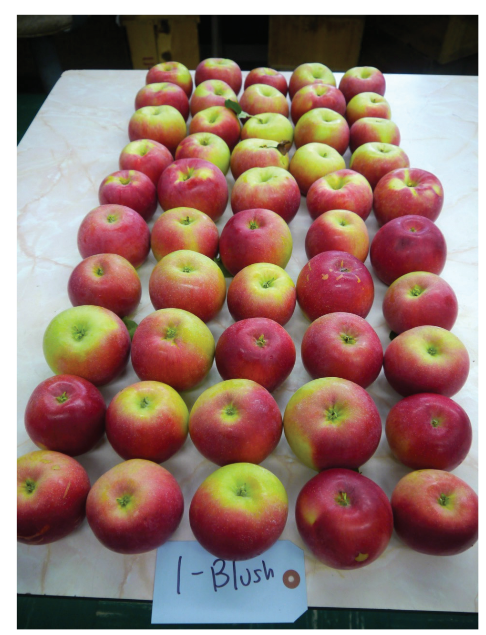
Figure 3. Zestar! apples treated with Blush evaluated for percent red skin over-color and red skin brilliance.

(2X). Both applications were made in the morning during fair weather and moderately rapid drying conditions.