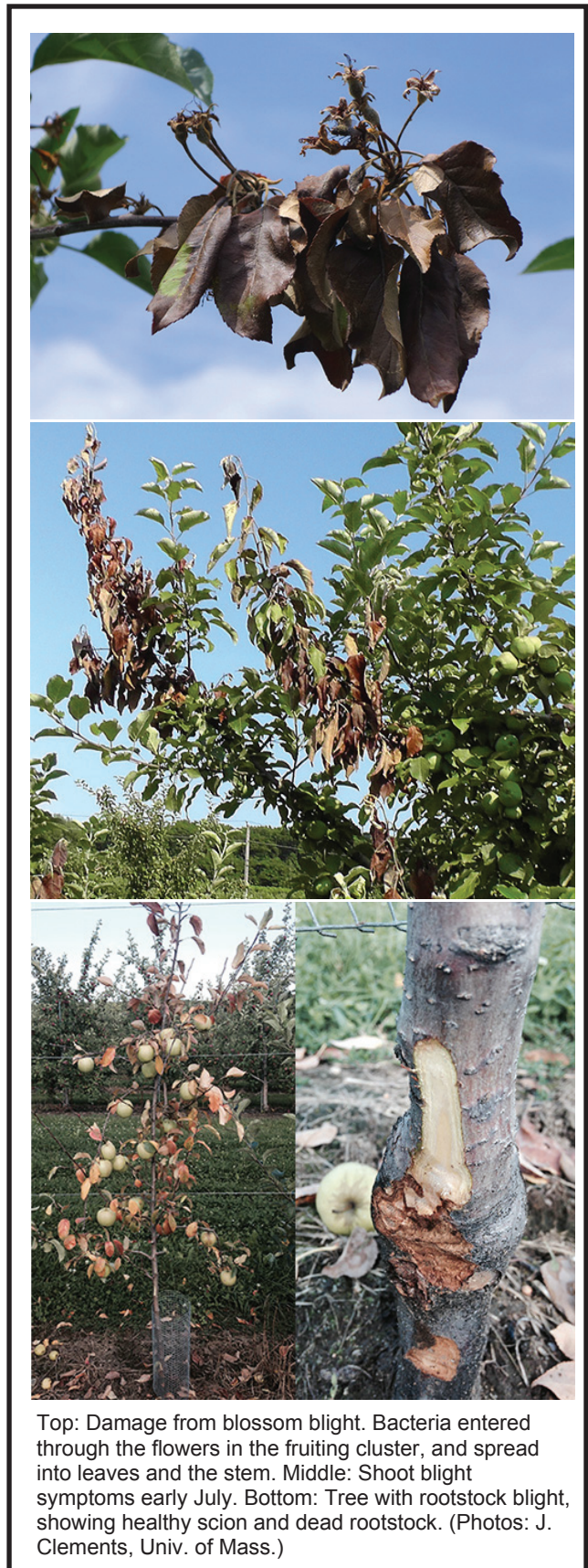
Top: Damage from blossom blight. Bacteria entered through the flowers in the fruiting cluster, and spread into leaves and the stem. Middle: Shoot blight symptoms early July. Bottom: Tree with rootstock blight, showing healthy scion and dead rootstock.

Trauma blight. Sometimes physical damage may