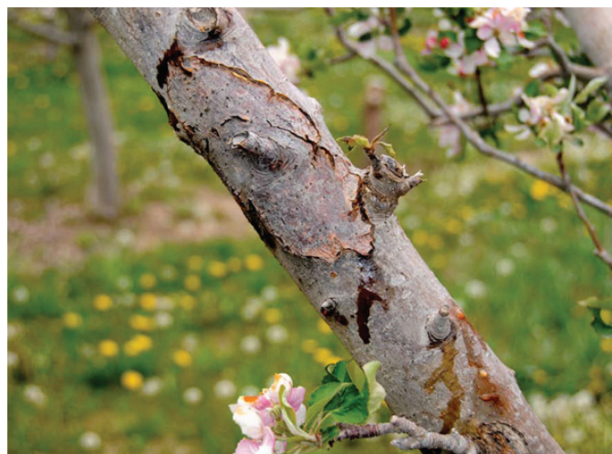
Canker blight. The canker in this picture is active, with the bacterial ooze showing on the bark surface.

Blossom blight. Near bloom, the number of bacte-