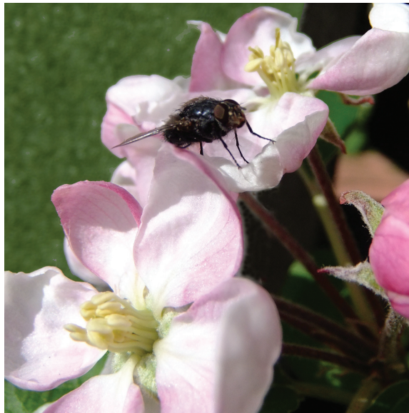
Insects carry fire blight bacteria from apple blossom to apple blossom.

There are several biopesticides registered for use against fire blight, but these also are not as effective as streptomycin. These products include Bloomtime (bacteria, Pantoea agglomerans ), BlightBan (bacteria, Pseudomonas fluorescens A506), Serenade (bacteria, Bacillus subtilis qst 713), Double Nickel (bacteria, Bacillus amyloliquefaciens D 747), Actinovate (bacteria, Streptomyces lydicus WYEC 108) and Regalia (a plant extract from giant knotweed). Blossom Protect (yeast, Aureobasidium pullulans ) is registered in some