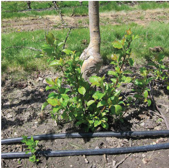
Root suckers at the base of an apple tree.

**Bud 9 is sensitive to fire blight in laboratory tests, but shows resistance in field tests, particularly on trees over 3 yr old