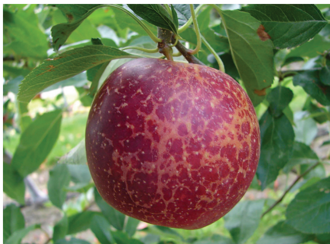
Russet caused by copper on apple fruit.

To preserve its effectiveness, streptomycin should not be overused. If risk of fire blight is low, then it should not be sprayed. The only time streptomycin should be used is when there is a predicted risk of fire blight during bloom. Streptomycin is not effective against cankers or shoot blight, and should not be used in protective sprays targeting either problem. Using it at this time promotes resistance. (There is one exception