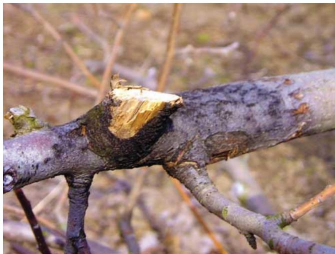
Dormant fire blight canker. It should have been pruned out when the infected branch was pruned, rather than leaving it in the orchard.

2 – Early season copper. Regardless of whether fire blight has been a problem in the past, at silver tip to green tip growers should apply copper to the orchard. Copper is applied because it is toxic to the fire blight bacteria. It is applied this early in the season because it