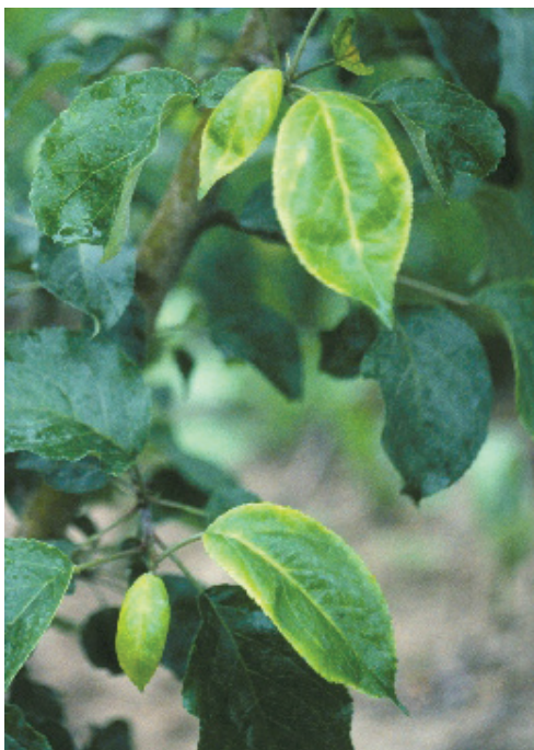
Streptomycin injury on apple leaves.

states, but not New England. The performance of these biologicals is less consistent than the antibiotics, particularly streptomycin. In tests where they have been effective, they at best achieve about half the level of control as streptomycin.