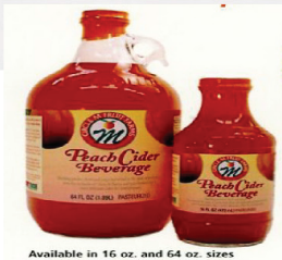
Available in 16 oz. and 64 oz. sizes

Made from fresh New Jersey Peaches "Peach Cider Drink, Peach Salsa, Peach Preserves"