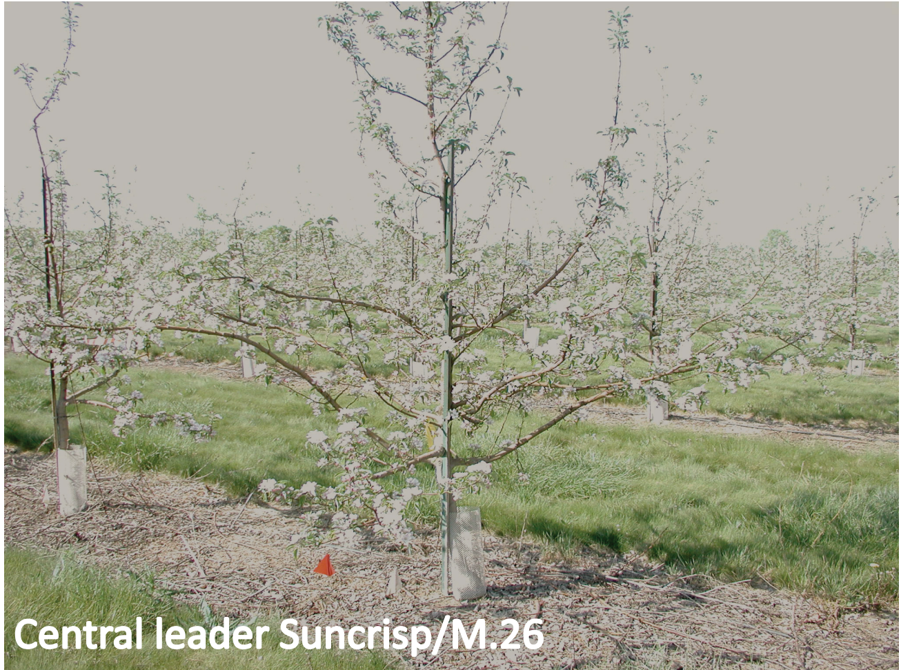
Central leader Suncrisp/M.26

growth at the site of the cut and the three to four buds below it. On a non-bearing tree, this type of stimuli causes the tree to remain in the vegetative mode, which delays cropping. For this reason, pruning young non-bearing trees should be minimized to correct major structural defects. Tree training and minimal corrective pruning of tree structure in the early non-bearing years will enhance the development of a new orchard ensuring the trees fill their space and begin fruiting.