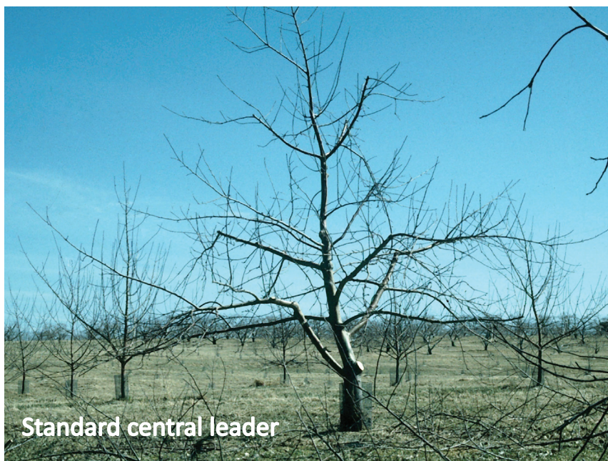
Standard central leader

wood will have a good amount of spurs and produce the best apples; and 3-year old wood will still produce fruit but is ready to make way for new fruiting wood using a thinning/renewal cut. In the ideal, you would have a nice balance of 1/3 each of 1-, 2-, and 3-year old wood. This applies to most all orchard pruning and training systems, although older, central-leader orchards will have to keep older structural wood (in addition to the central-leader) in lateral branches (scaffold limbs) to grow younger wood from and support the crop load.