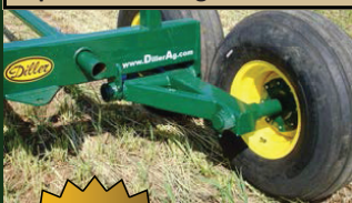
Optional Walking Beam Axles