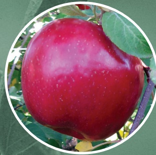
Aztec Fuji® DT2 Variety High color sport of Fuji. Aztec® Fuji is a protected trademark of Waimca Variety Management Ltd.