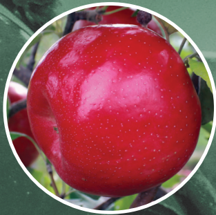
Royal Red Honeycrisp® High color sport of Honeycrisp. USPP#22,244