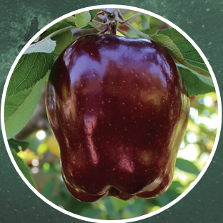
Chelan Spur™ Very compact, high color red delicious sport. USPPAF