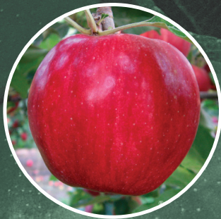
Brookfield Gala® High color Gala sport with exceptional shape. USPP#10,016