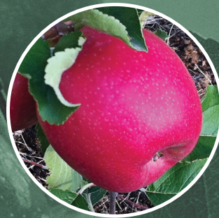
Lady in Red High color sport of Cripps Pink. USPP#18,787