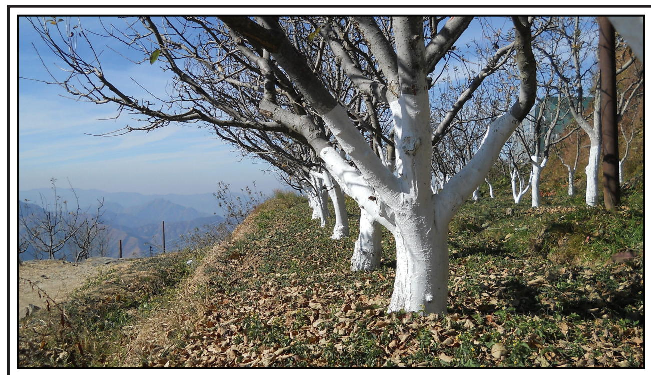
Photo 1. A typical Delicious orchard, Mashobra Research Station, Himachal Pradesh, located 7000 feet above sea level.

But in India, Delicious is still the favorite apple. Close to 80 percent of the Delicious grown in Himachal are still the same old Stark strain from the Stark Brothers Nursery, Louisiana, Missouri, which is still popular because of its taste. This good flavor is one of reasons why Delicious is still the predominant variety grown here. Another reason is the less vulnerability to bruising