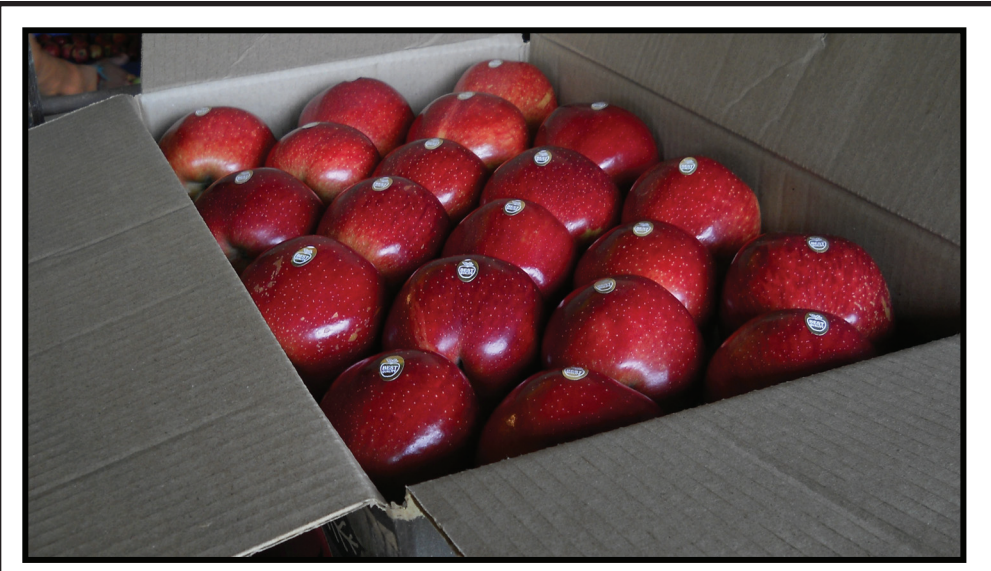
Photo 2. A Box of the Stark strain of Delicious, from an orchard in Kotkhai, India.

our season a short one. As a result, most of our Delicious apples have a short shelf life and must reach the market very quickly. However, India is a big country with 1.4 billion mouths to feed. Eighty percent of our 3 million tons of fruit ends up as fruit for fresh market consumption. These Indian Delicious apples never go out of demand!