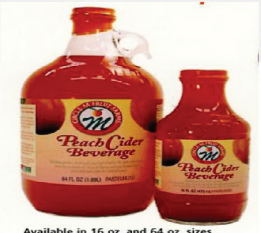
Available in 16 oz. and 64 oz. sizes

Made from fresh New Jersey Peaches "Peach Cider Drink, Peach Salsa, Peach Preserves"