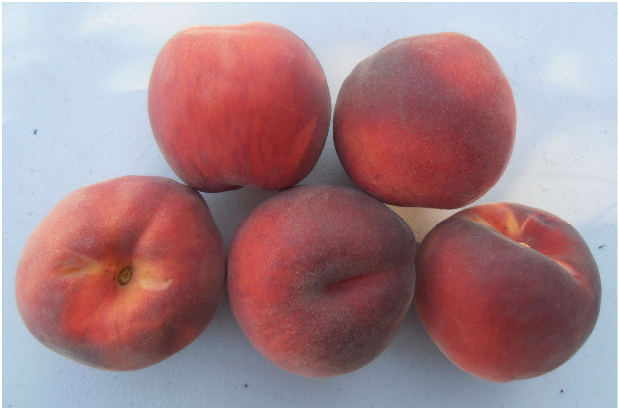
Figure 2. Fruit of Evelynn a new peach from the Stone Fruit Breeding Program of Rutgers/NJAES.