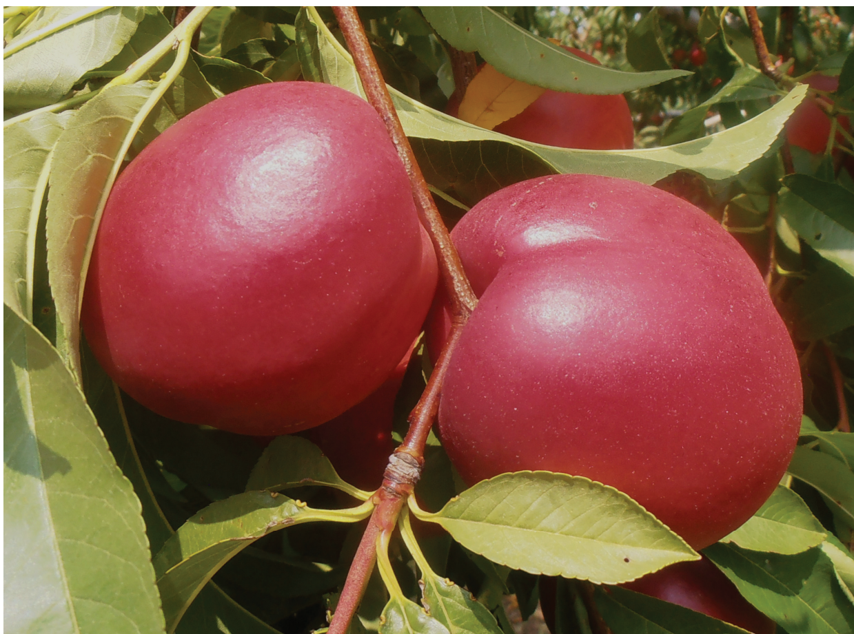
Figure 1. Fruit of Brigantine nectarine from the Stone Fruit Breeding Program of Rutgers/NJAES.

For each study fruit were harvested from three to five-year-old trees established in commercial orchards in southern New Jersey. Harvesting at the time of com-