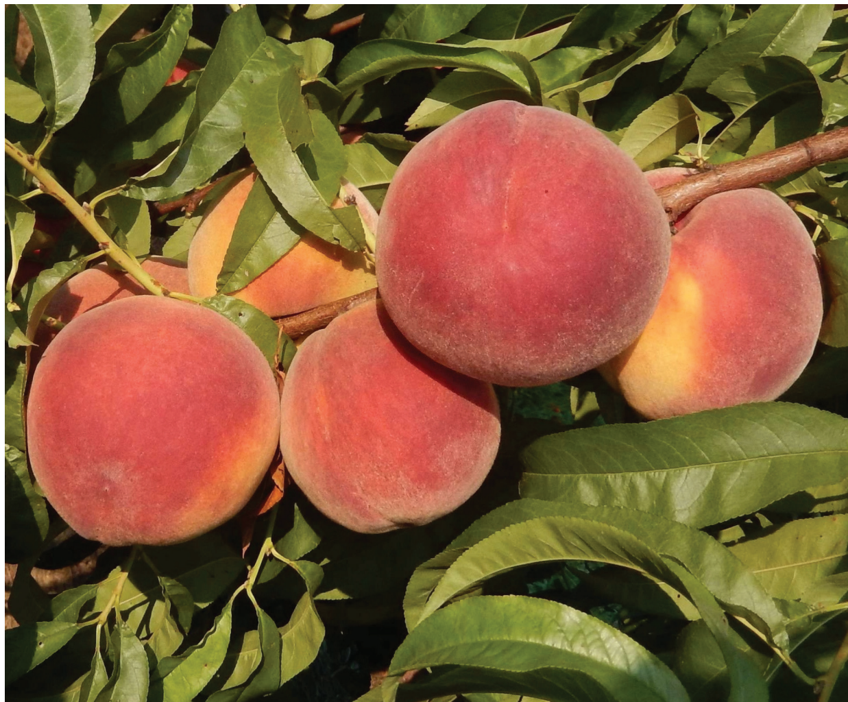
Figure 3. Fruit of Tiana a new peach from the Stone Fruit Breeding Program of Rutgers/NJAES.