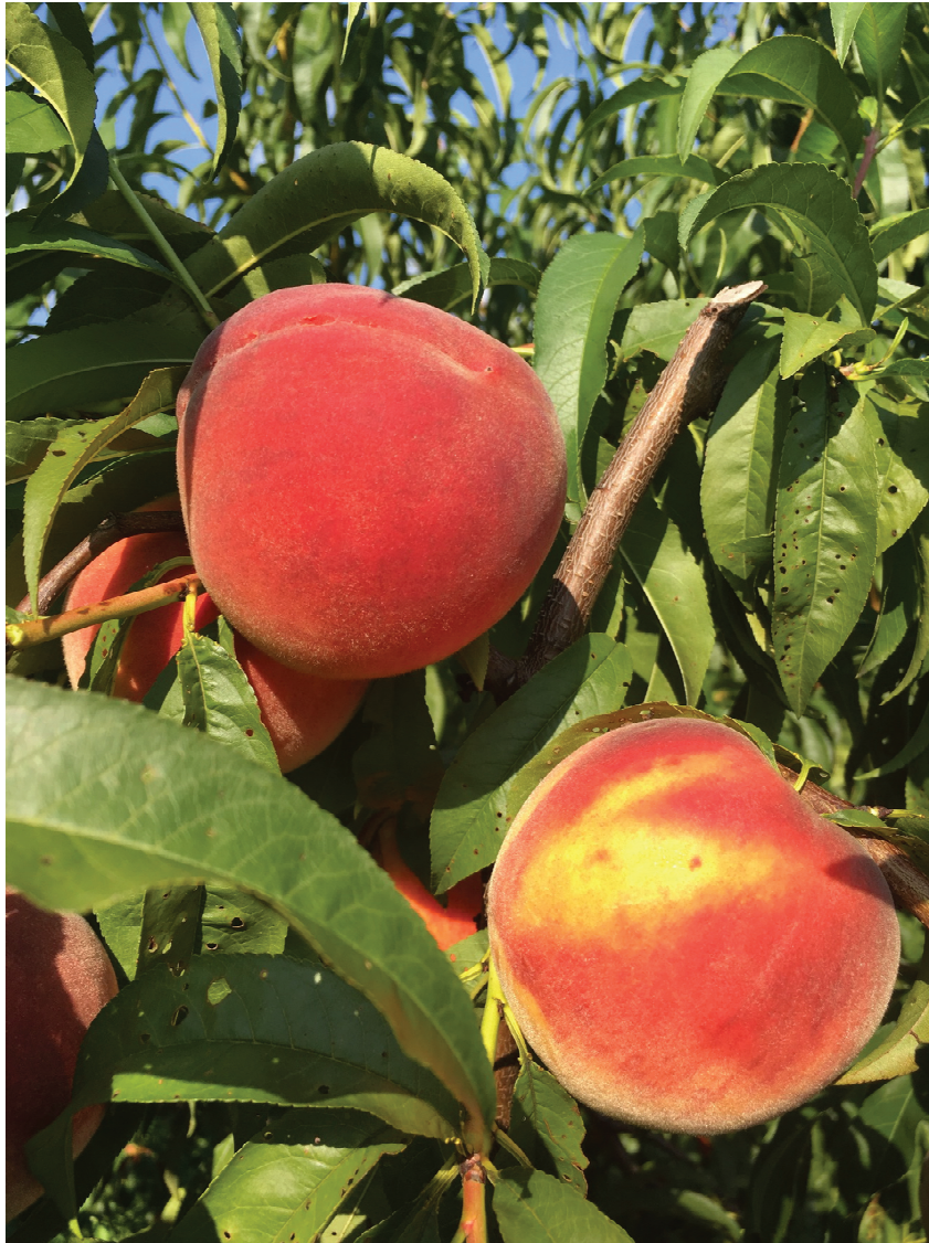
Figure 1. Fruit of Selena peach from the Stone Fruit Breeding Program of Rutgers/NJAES.